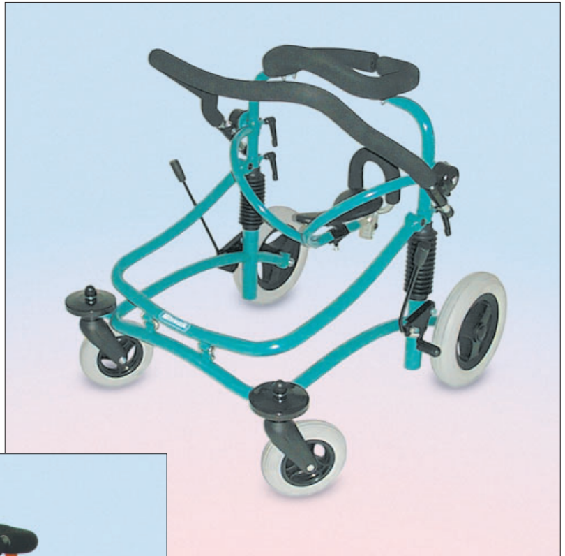
MINIWALK® size no. 1.