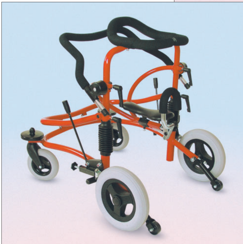
MINIWALK® size no. 2 with accessories.

MINIWALK® from Meyland-Smith in Denmark is the newest model of walking supports for small children from approx. 1½ to 7 years of age. The walking support is based on the famous lines and qualities of MEYWALK®. The height of the trunk support and seat are adjusted quickly and stepless with spanner grips. MINIWALK® is available in two sizes, where size no. 1 is for children from 1½ to 4 years of age and size no. 2 is for children from 4 to 7 years of age. The seat and trunk support has spring suspension to encourage a better and more natural gait. The body posture of the child can be set in any position from